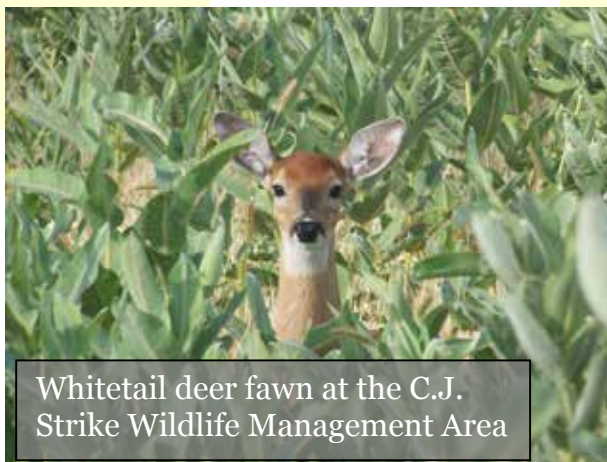
Whitetail deer fawn at the C.J. Strike Wildlife Management Area