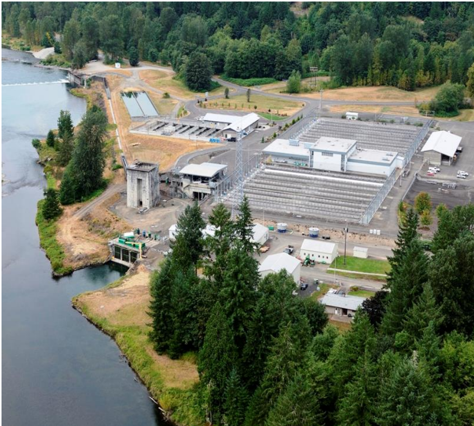
Cowlitz Salmon Hatchery