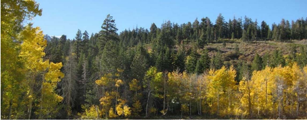
Valentine Eastern Sierra Reserve