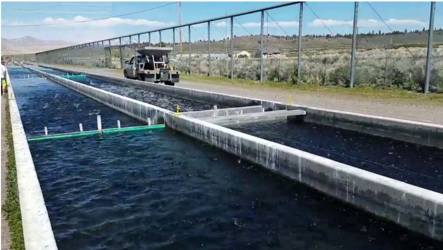
Hot Creek Trout Hatchery