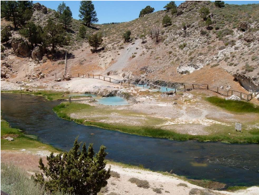
Hot Creek Geologic Site