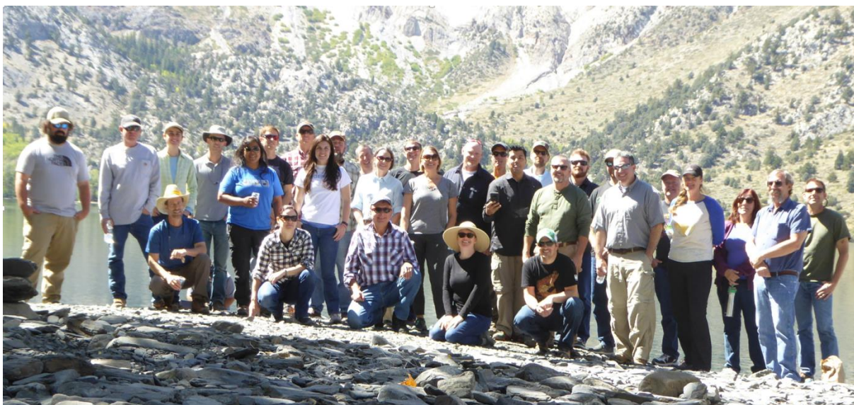
APB Lunch Break at Convict Lake