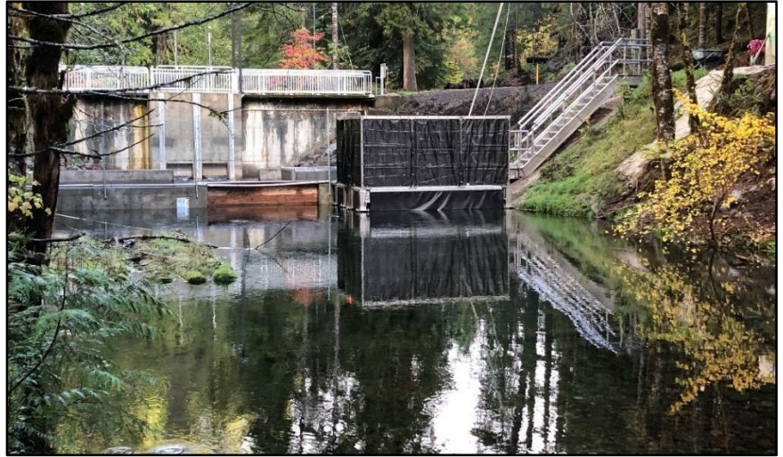
EWEB's Experimental Temporary Trap and Haul Facility